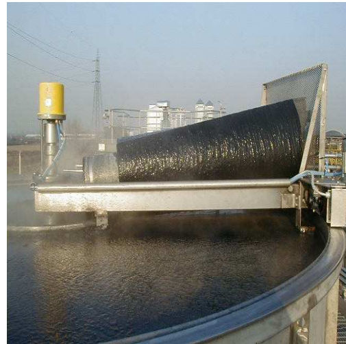
Aqua DAF 10

Unprecedented clarification efficiency is attained by the unique micro-bubble screening system: a recent exclusive break-through in this technology.