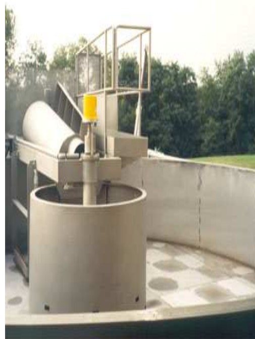
Aqua DAF 30