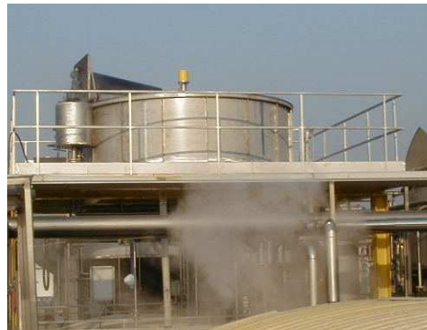
Aqua DAF 10