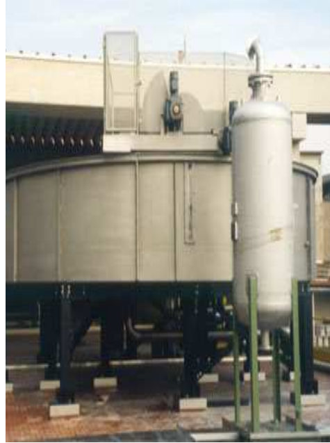
Aqua DAF 30

Colloide reserve the right to alter these dimensions without notice