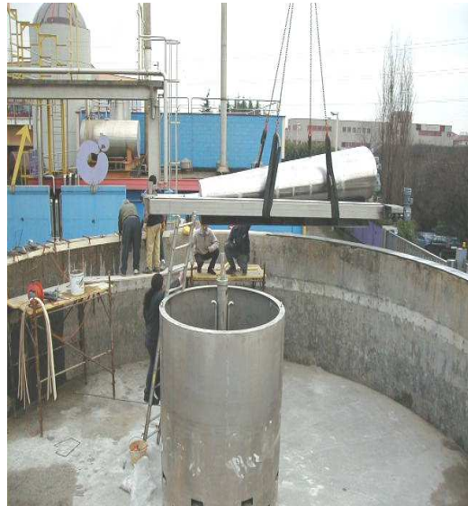
Aqua DAF 75 - Installed in concrete basin