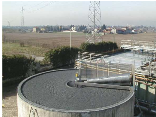
Aqua DAF 75 - Installed in concrete basin